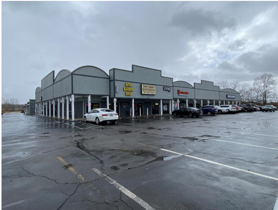
3) View of abutting lot to north, zoned C-2, facing southeast.