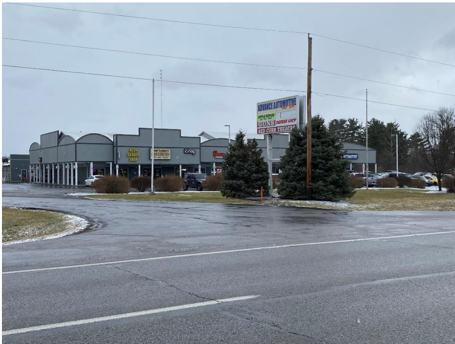
2) View of abutting lot to north and subject property access, facing southeast from US 36.