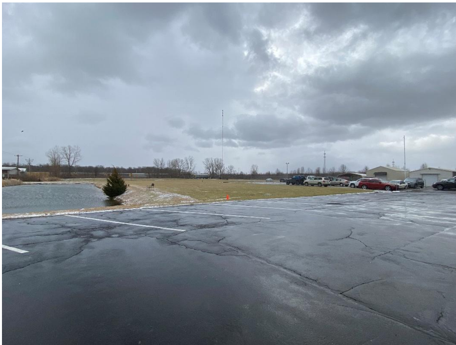
4) Abutting lot to southwest, zoned I-2, facing southeast from SE corner of subject property.