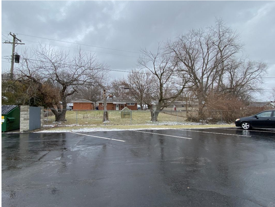
5) View of abutting properties to east, facing east from subject property.