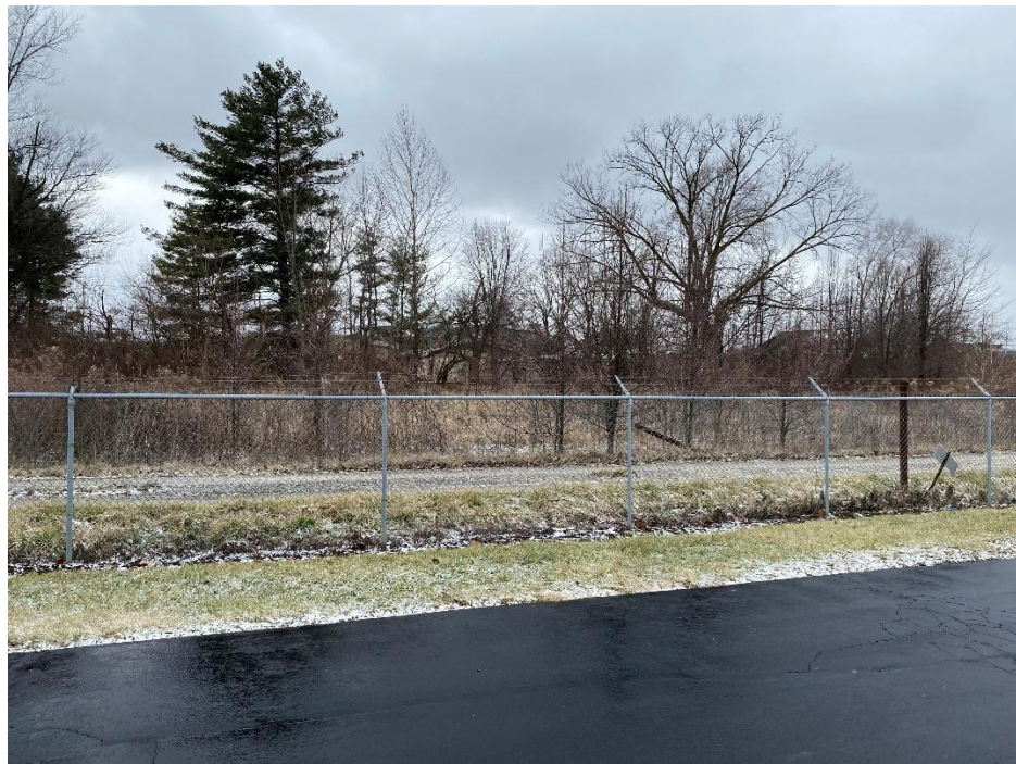
6) View of abutting properties to west, facing west from subject property.