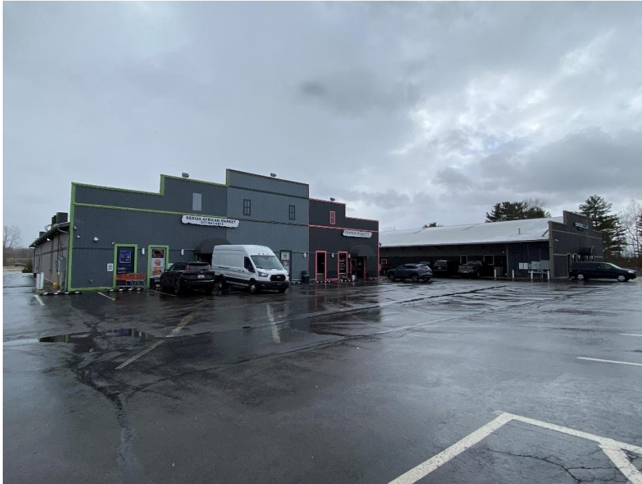
1) View of subject property, facing southwest from near northeast corner of lot.